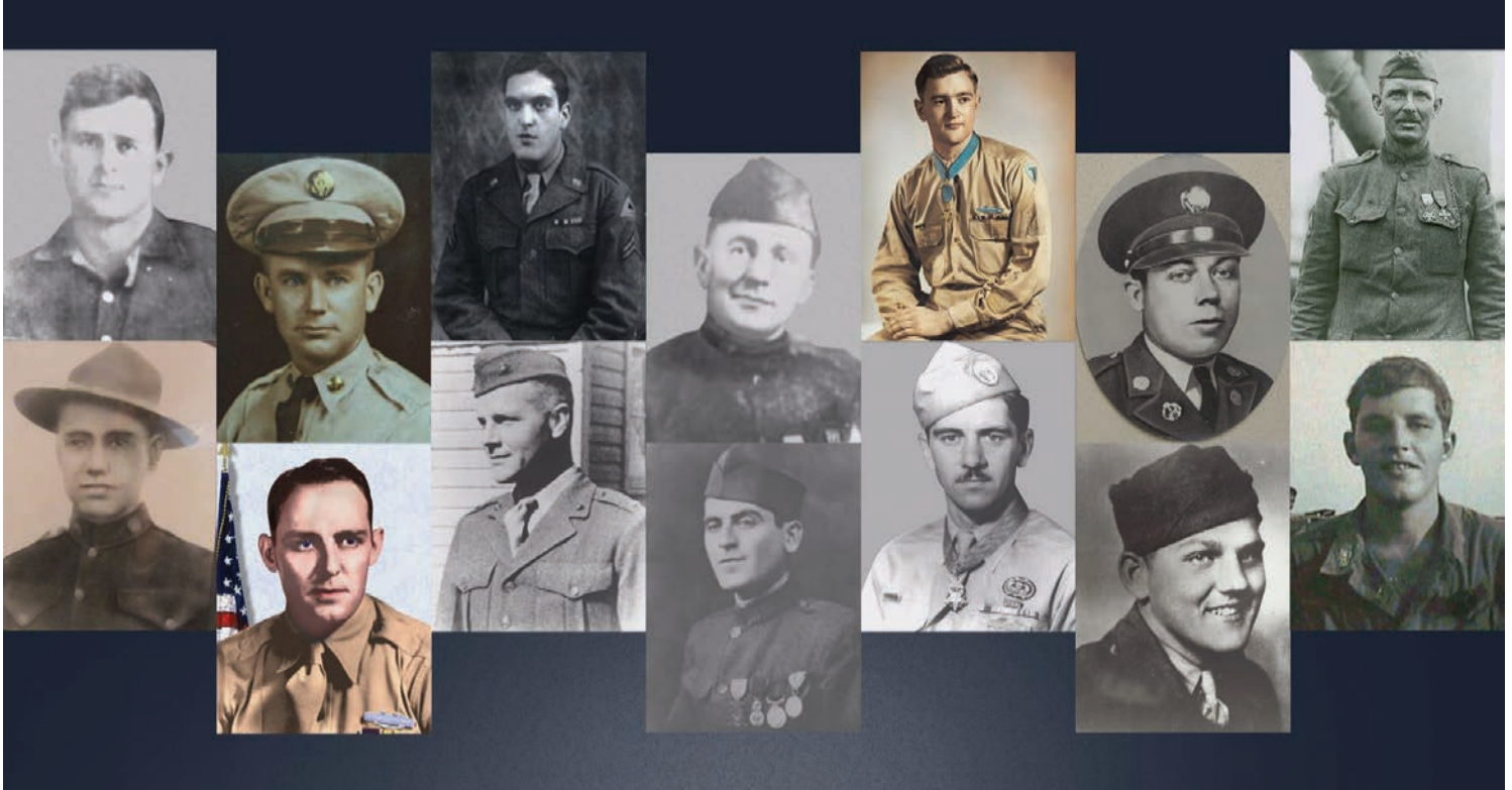
PHOTO MONTAGE OF EAST TENNESSEE MEDAL OF HONOR RECIPIENTS