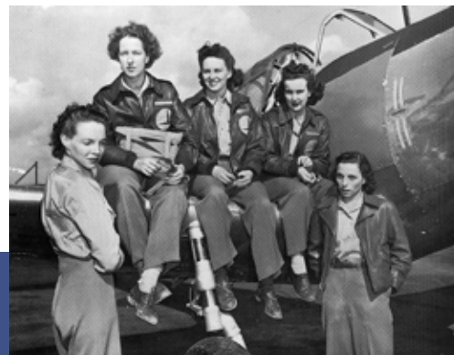
LEFT: CORNELIA FORT